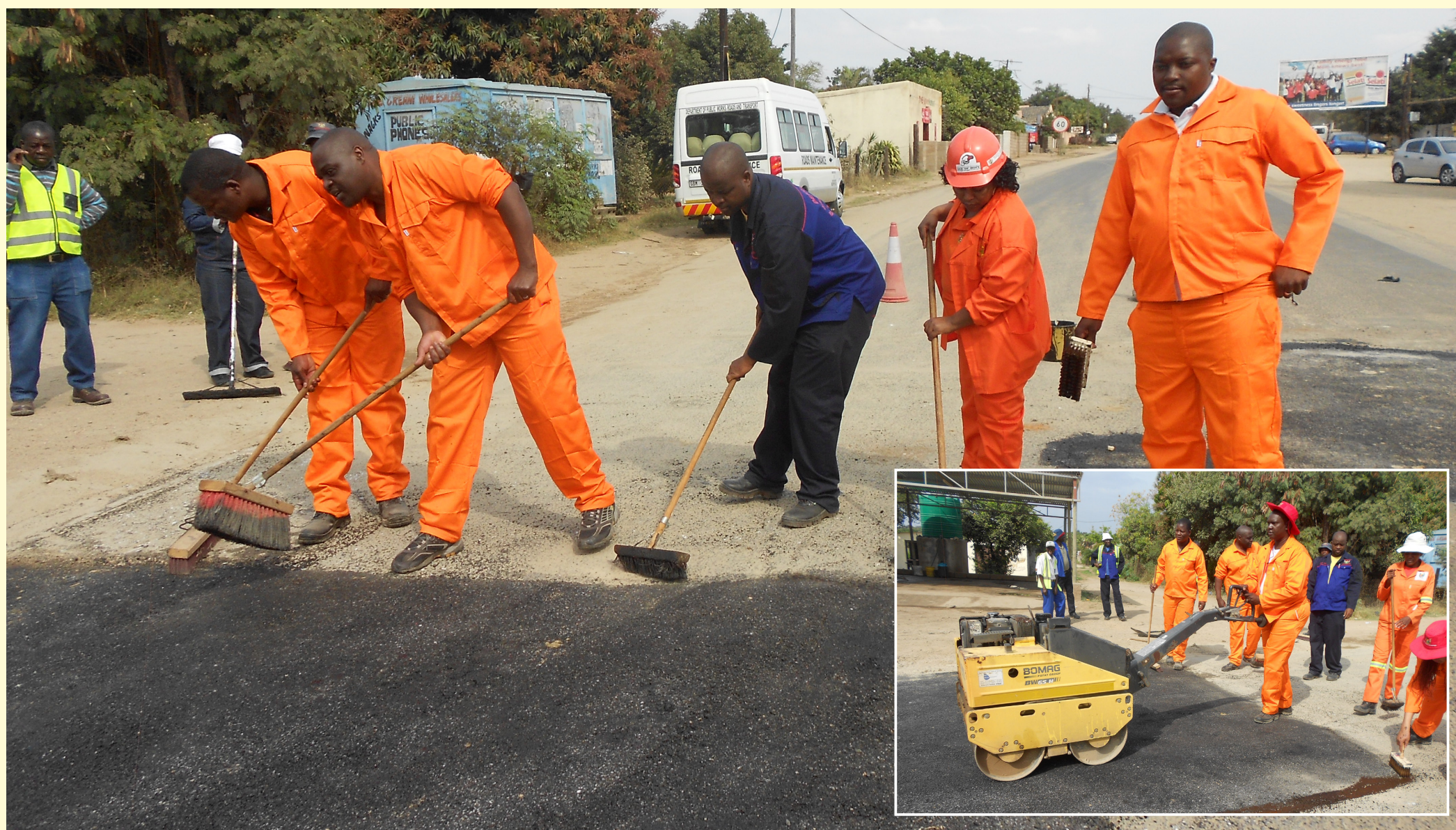
Officials from the Department busy patching potholes during the Mandela month.

Officials from Ehlanzeni District including their management left their air conditioned offices to patch potholes in the streets of Ka-Mhlushwa on Thursday the 25th of July 2013, as part of their contribution towards the Mandela Day celebration. Dressed in their orange overalls, even the unfavourable weather condition which was extremely hot did not dampen their high spirits and dedication to participate in the special occasion. It was a relief to road