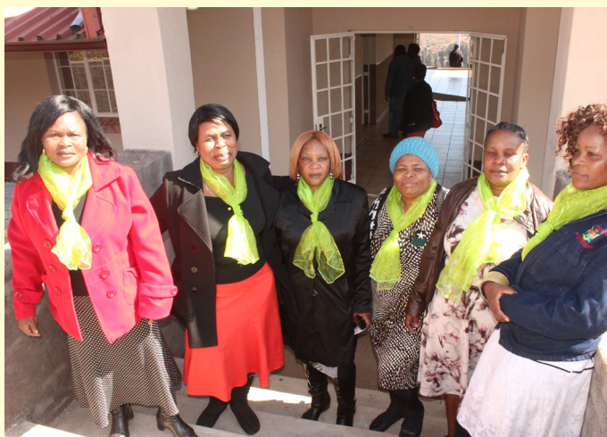
Power to the women.