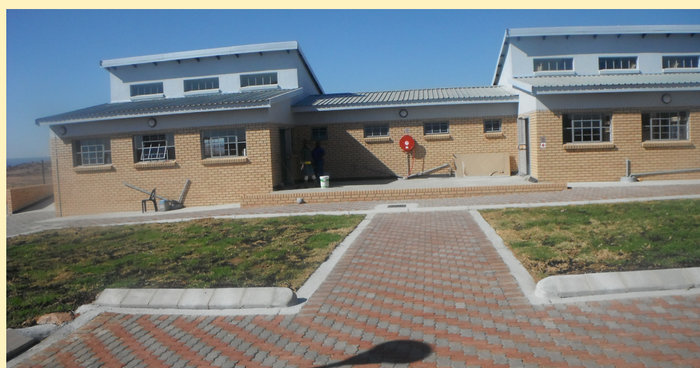
The special school that is built by the Department.

dedicating time changing the lives of the people, "as a Department we have a responsibility of making the lives of those using the road better by ensuring that they drive in a smooth and safe road," he said. After serving their 67 minutes of community work, the tired team from Ehlanzeni left the streets of Ka-Mhlushwa extremely exhausted as some have never worked on the road before, however they will cherish the day and their contribution forever.