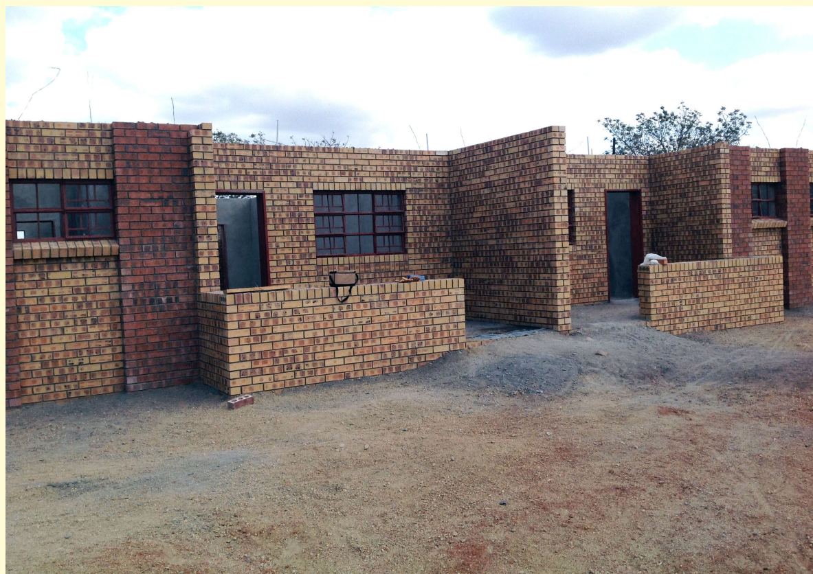
The new structure of the clinic under construction.

It was really hard for the community because we did not have a clinic. We had to travel a long distance to get health assistance and it was frustrating. The new clinic will really assist us a lot"