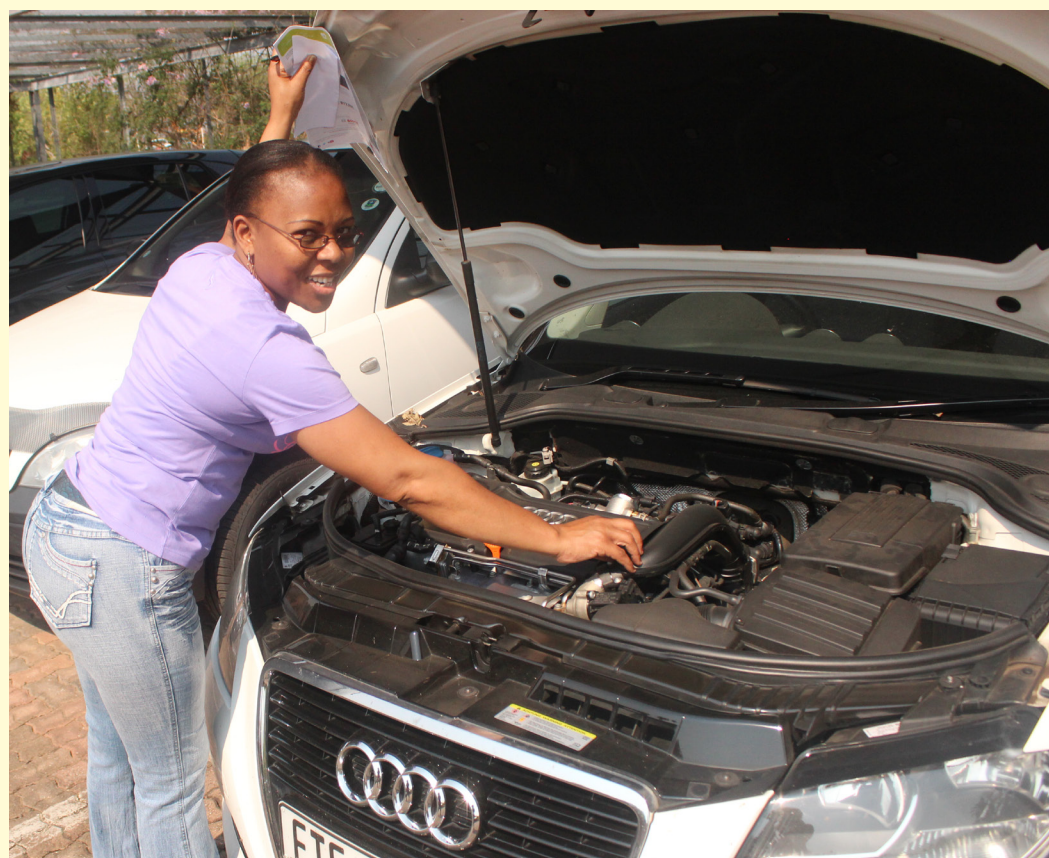
Some of the vehicles that have been inspected by the Department.

The Department recently conducted a physical verification of subsidy vehicles. The verification started at Head Office and it continued to all the four Districts that includes amongst others Ehlanzeni, Nkangala, Gert Sibande, and Bohlabela.