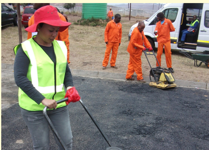
Cool and collected.