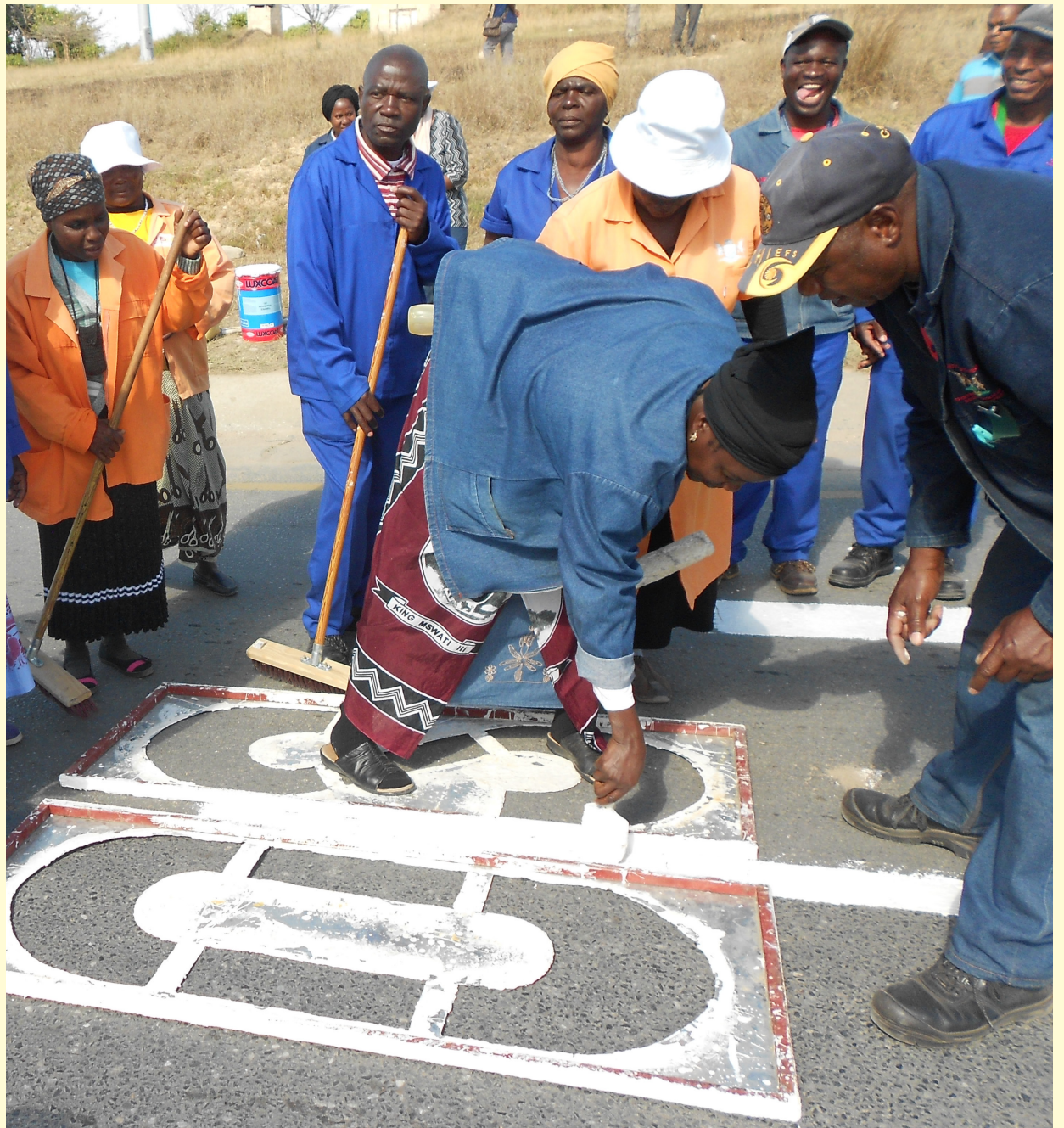
Road workers at Bohlabela District hard at work painting the road.

T he Bohlabela District officially closed the Mandela Month with activities held in two (2) Local Municipalities (Thaba Chweu and Bushbuckridge). The activities started on the 30th of July 2013 at Pilgrims Rest Town where sanitary towels, blankets, clothes and Food Parcels were donated. The donations were followed by grass cutting and patching of potholes at a place called Skoon Plaas. There were 43 beneficiaries of sanitary towels from Pilgrims Rest High school and Primary school. Community members also benefited from food parcels. Five (5) disadvantaged families were identified and handed food parcels, blankets and clothes during the event.