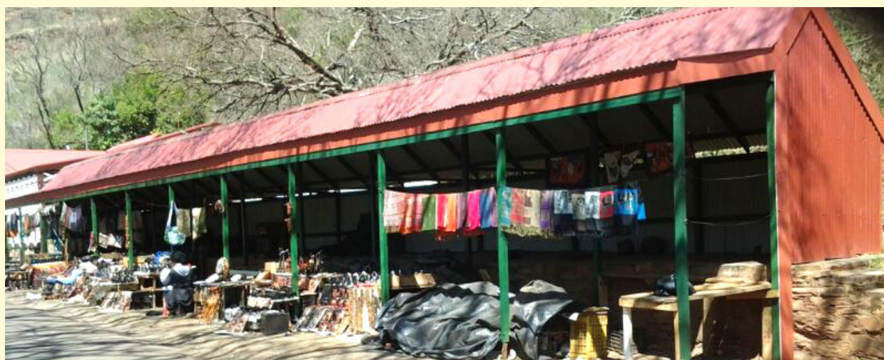
The hawkers stands that have been built at Pilgrim's Rest.