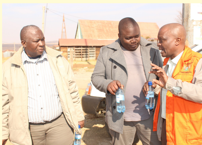
Putting our heads together.