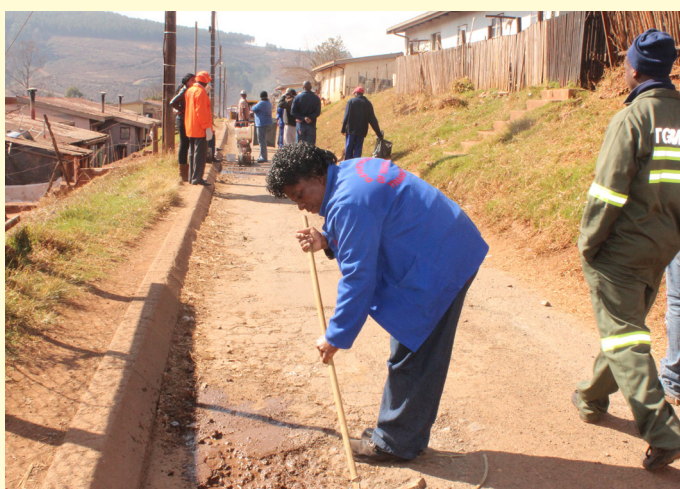
Working for our community