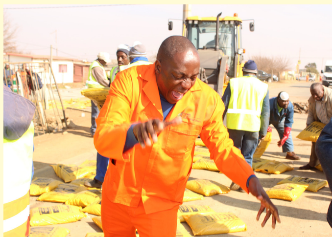
Men at work.