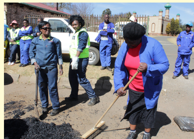
This is how it is done.