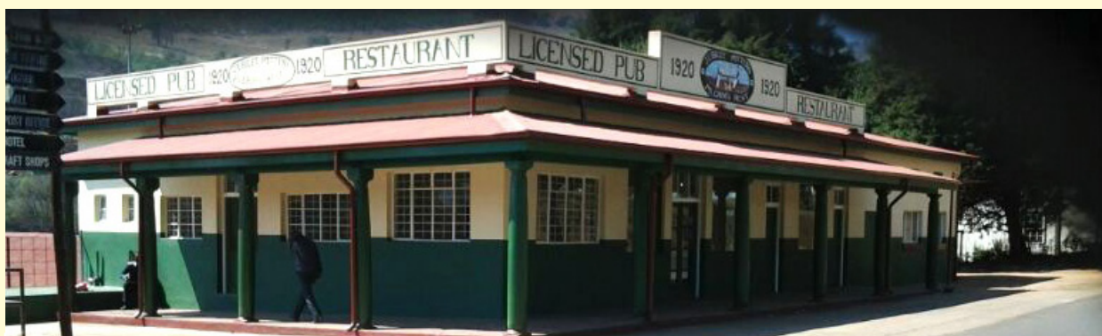
One of the businesses that have been renovated.