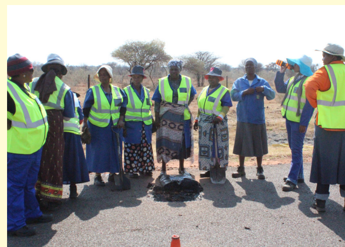
Getting ready for the job.