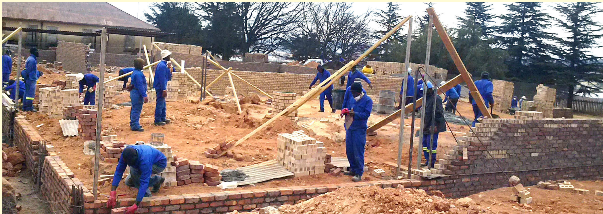
The foundation of the new Supply Chain Stores and offices in the Msukaligwa Local Municipality.

The Department is currently accelerating service delivery through infrastructure development across the district in the 2013/14 financial year. The Department is constructing the new supply chain stores and offices at Msukaligwa Local Municipality. The project has so