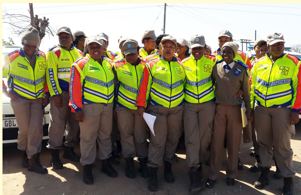
Female Transport Inspectors were hard at work during the August Month.

M otorists in the province were caught by surprise when their roads were flooded by Department's women inspectorate team in the spirit of celebrating Women's Month Programme. The programme commenced on the 16 of August 2013 in Emalahleni Local Municipality, in a location called Vosman where they were targeting Public Transport.