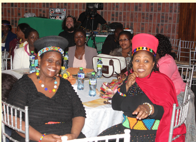
Wow, now that's a good move.