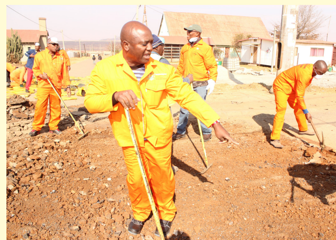
This way please.