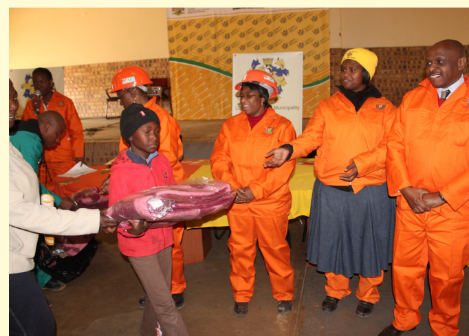
Road safety is our business