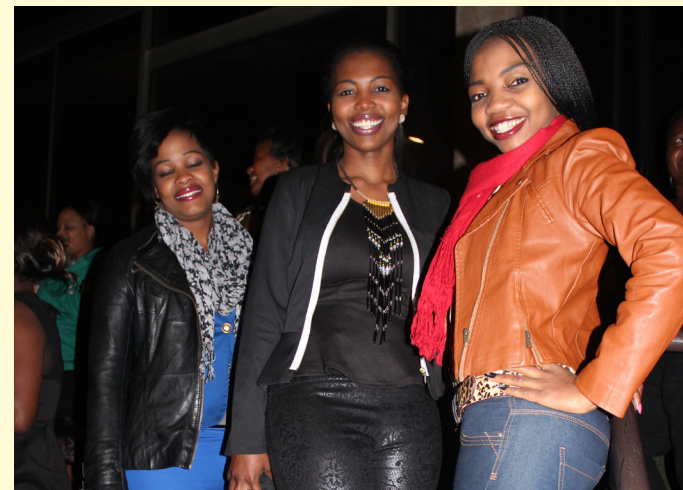
We were there.