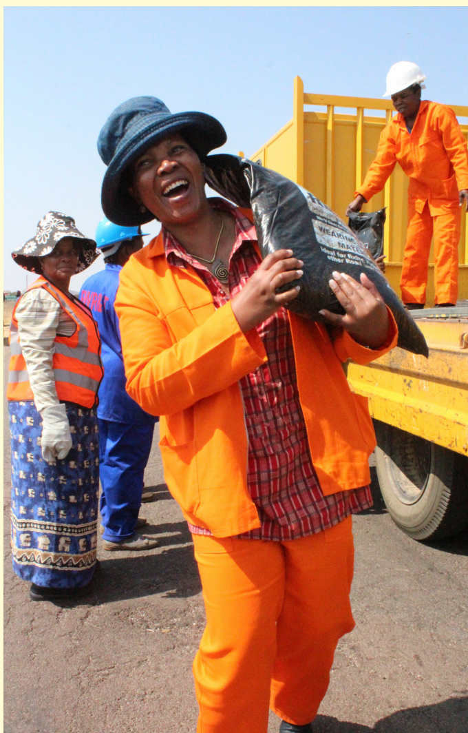
Not heavy at all.