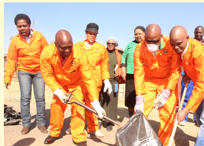
Doing it the right way.