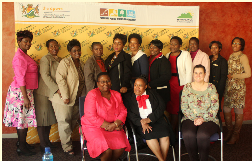
Some women in management in the Department.