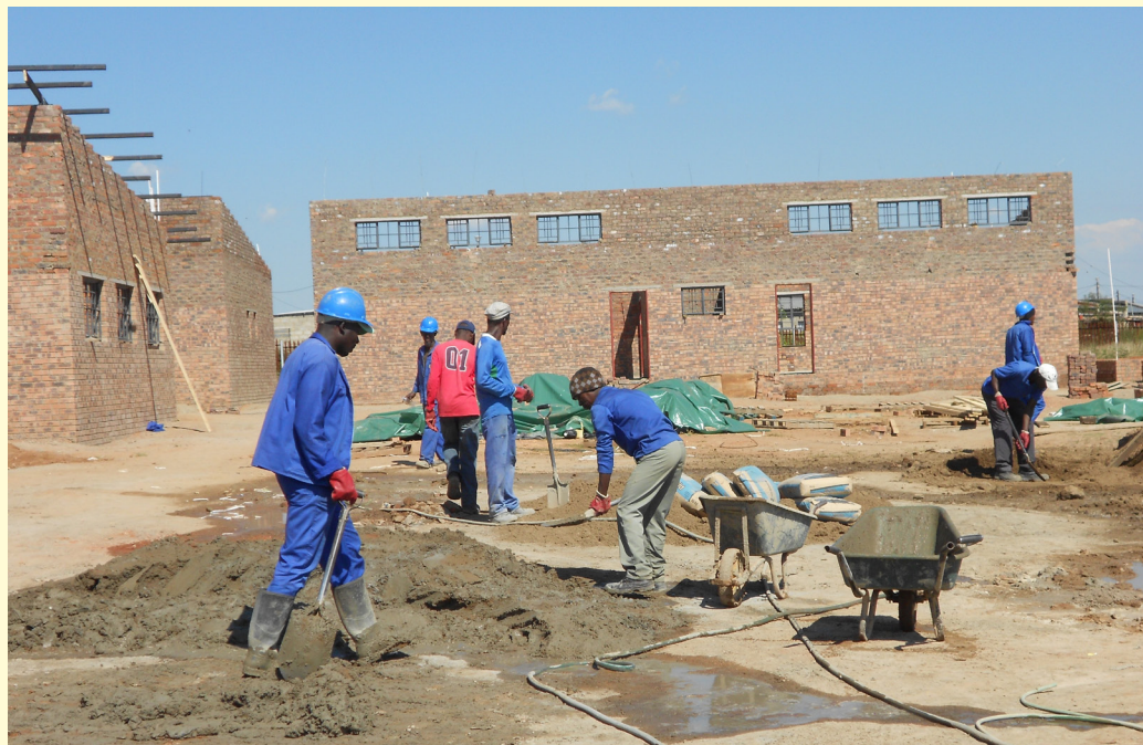
Under construction is Buhle Secondary School.