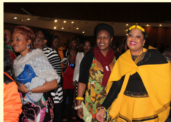
We still love and respect our culture.