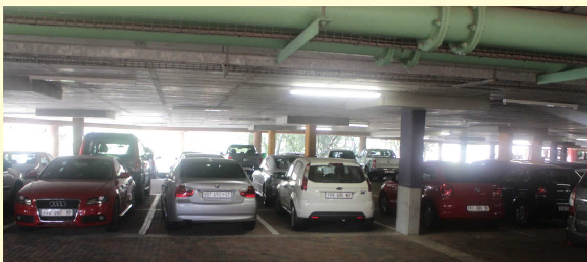
The parking that has been allocated to officials in the Government complex.

The open space in front of buildings has been made available for visitors, Drop off's and delivery vehicles. Mr Ngono concluded by saying vehicles that will be found to have parked in the wrong space will be clamped and only released after a payment of R100.00 fine.