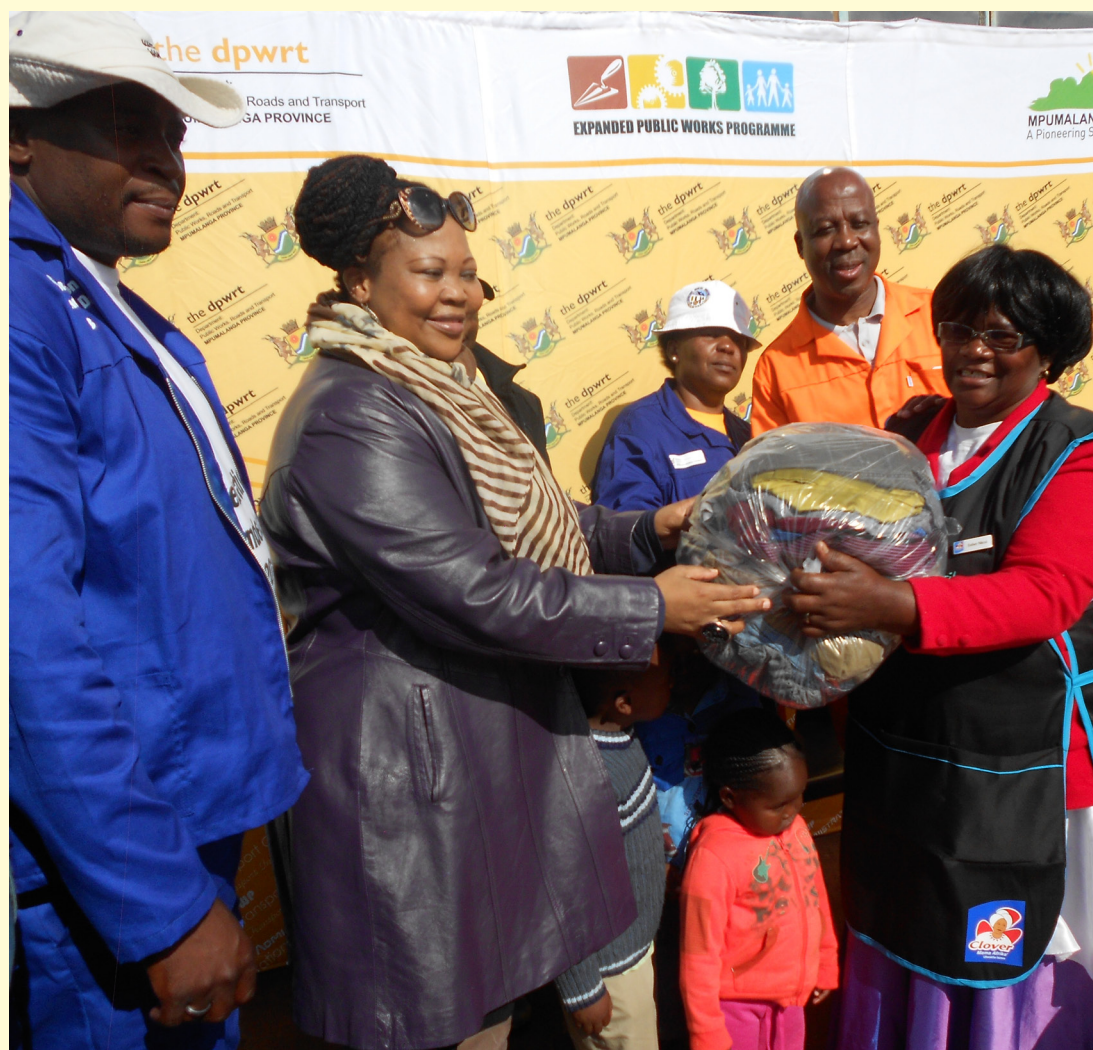
The MEC and HOD donating food parcels and blankets to the orphanage.

The MEC further made a commitment that the Department's contribution will not end on Mandela month but will continue beyond the