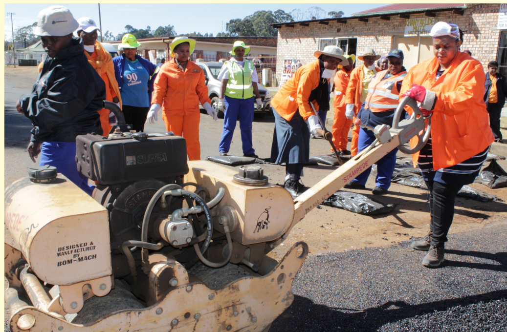
Heavy duty work is a child's play for these female officials.

I t was a windy, cold and misty day at Emakhazeni Local Municipality, Belfast at Bhekumuzi Masango Street next to the taxi rank on the 6th of August 2013 when female officials within the Department were hard at work patching potholes as an initiative of the departmental women programme.