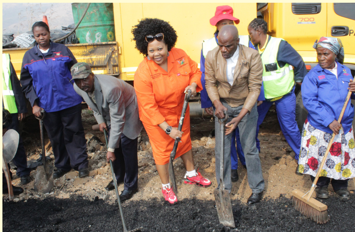
Showing them how it is done is MEC Dikeledi Mahlangu (orange overall) and The Executive Mayor of Umjindi Local Municipality Cllr Lazarus Mashaba.

The MEC for Mpumalanga Department of Public Works, Roads and Transport, Dikeledi Mahlangu took time from her busy schedule and visited Barberton in the Mjindi Local Municipality as part of celebrating Women's Month. The MEC together with the Executive Mayor of Mjindi Local Municipality, Cllr Lazarus Mashaba led a team of female officials as they embarked on various