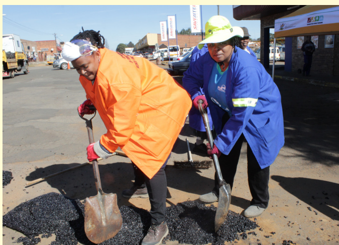
Getting mpumalanga to work.