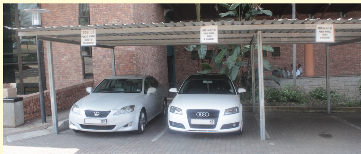
Parking bays allocated to HOD's and MEC's next to the offices of Departments.