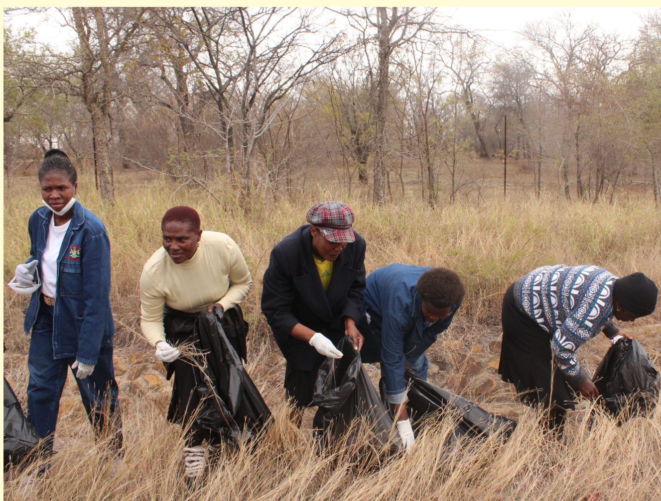
Female officials busy cleaning and cutting the grass in Bohlabela District.

Female Officials within the Department rolled their sleeves and wore their overalls on the 20th of August 2013 when they were cutting the grass along the road to Mkhuhlu Kruger Gate, as part of their contribution to the Women's Month Celebration.