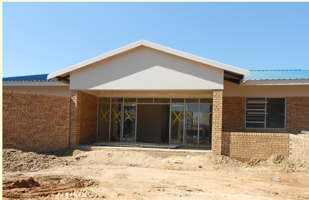
The mortuary that is nearly completed.

The determination and commitment from government to provide the much needed infrastructure within the rural parts of the province is displayed once again in the small town of Piet Retief. The state of the art building has been built at a tune of more than R38 million. Excitement was written all over the locals faces when they were employed to build