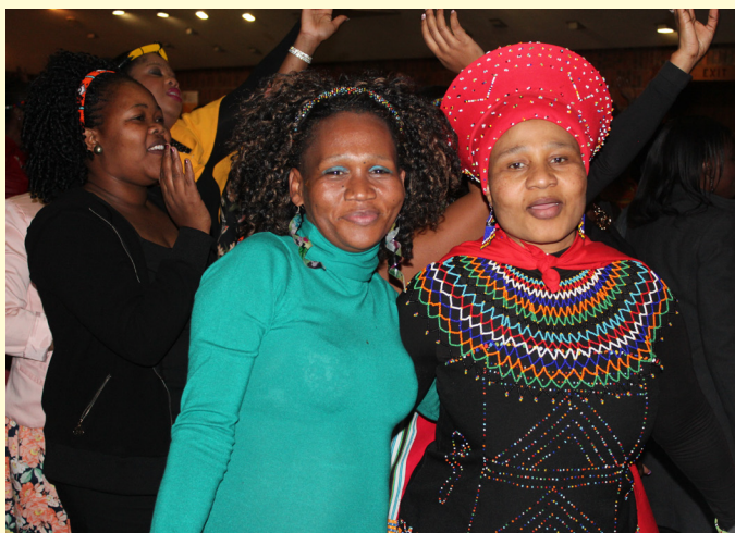
Proudly South African.