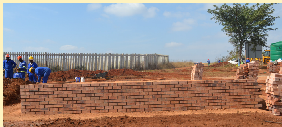
The foundation of the new government offices that are built by the Department in Bohlabela District.