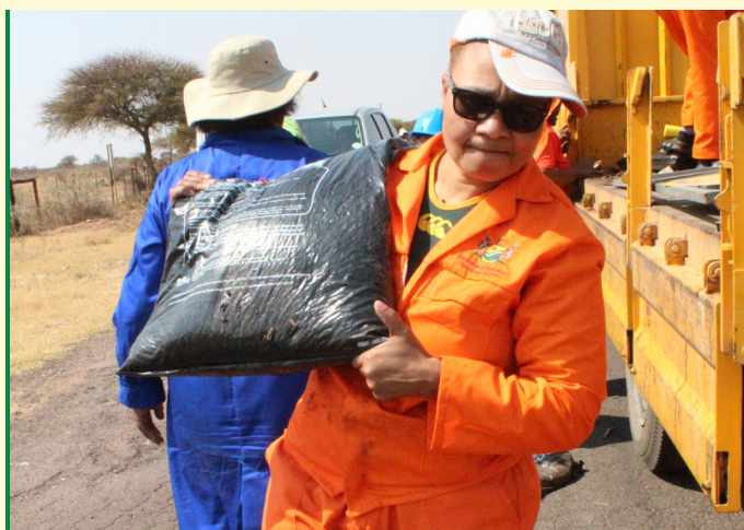
Contributing to a better future.