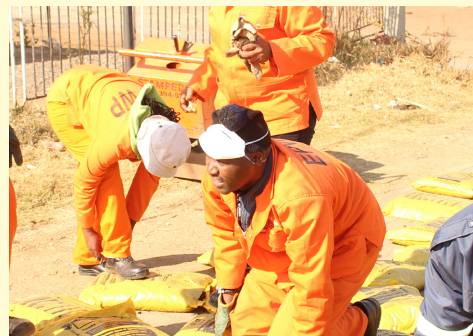
Doing it for mandela